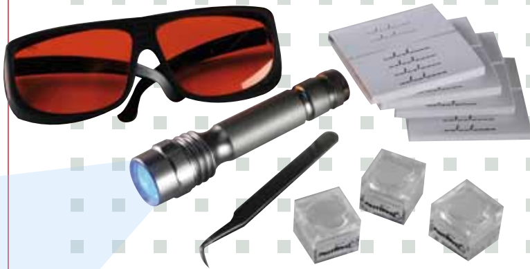
EYEWEAR & FLASHLIGHT STYLE MAY VARY, QUALITY WILL NOT

for the examiner to wear orange goggles which are included in the kit. Darken the room or area, shine the light at various surfaces where physical evidence might be found. Document and collect the specimens. The rechargeable blue LED flashlight is made of Aerospace-grade aluminum tempered Pyrex Lens; w/ Mil-Spec T type III hard-anodized, Weight (with battery) 8.7 ounces with an estimated life of the batteries is 300 hours without a significant decrease in power output. The estimated lifetime of the LEDs is about 11 years. The flashlight has been shock tested with a drop test of ten feet.