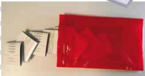
Easily bar coded or private labeled.